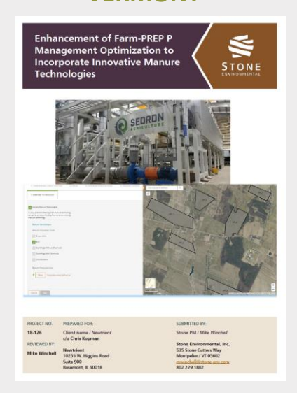
Link to Full Report